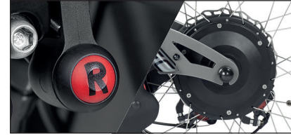
300 RPM 1440 W high-torque brushless motor with reverse gear. Maximum speed 30 km/h.