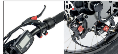
200/203 mm disc, two mechanical brakes, two aluminium levers with parking brake.