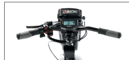
Handlebar option with right or left Monolever brakes for hemiplegics.