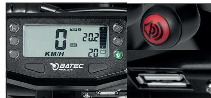
All-in-one LCD screen with gear selector. Horn and USB port.