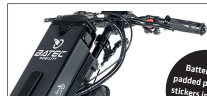
55 km* autonomy with 48 V – 768 Wh battery.

Battery with padded protective stickers in a matte black finish