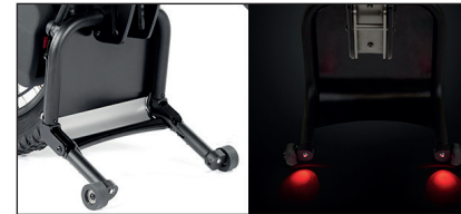
Stand frame with suspension. Includes double LED taillight.