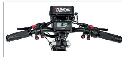
Matte black aluminium handlebar with folding system for convenience.

Battery with padded protective stickers in a matte black finish