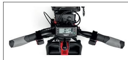
G&B handlebar option without levers for quadriplegics.