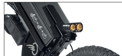
2000 lumens dual frontlight. Position and high beam lights. Retro-inspired yellow lens.