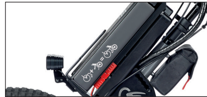
New proprietary electronics and anti-slip function.